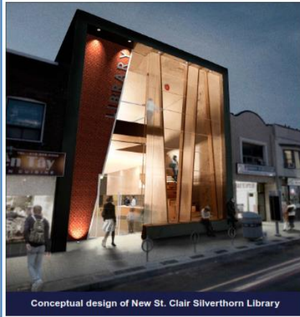
Conceptual design of New St. Clair Silverthorn Library

Construction of this brand NEW library is expected to be completed in 2019. Once completed, it will offer a completely new layout, barrier free access to the second floor, additional quiet space for studying, barrier free washrooms and an elevator. Signage will be installed on the plywood hoarding that faces the sidewalk, notifying the public of the project and providing details on other facilities that can be used in the interim. Conceptual renderings of the new façade and street improvements are displayed below.