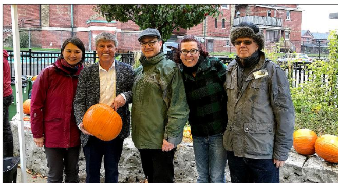
2017 Halloween Pumpkin carving sponsored by: Northcliffe Residents' Association, Regal Heights Residents' Association, and local Regal Heights Village BIA

Special thanks, to the students and school faculty of St. Nicholas of Bari Elementary School for working in partnership with my office, to bring this project to fruition.