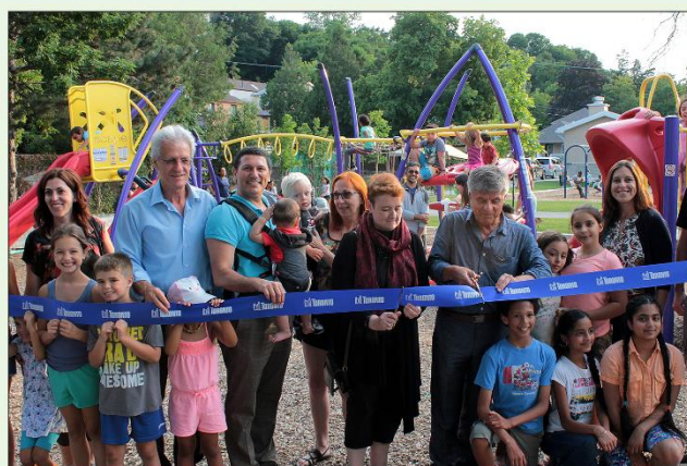
Charles Caccia Park

A follow up meeting will be held in early 2018, in the main lobby of the JJP Recreation Centre, so please make every effort to attend as your input is essential before any final decision is made. Stay tuned for meeting date.