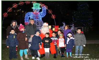
Wishing you and your loved ones a Happy Holiday Season & a healthy and prosperous New Year!