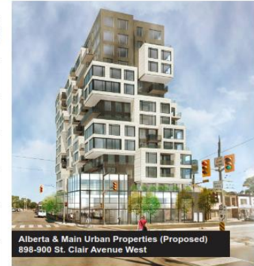
Alberta & Main Urban Properties (Proposed) 898-900 St. Clair Avenue West

For continued updates on these and other new developments, please contact my office.