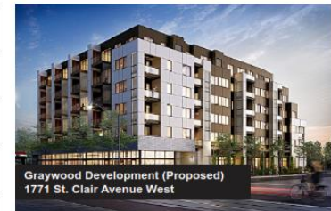
Graywood Development (Proposed) 1771 St. Clair Avenue West