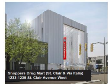
Shoppers Drug Mart (St. Clair & Via Italia) 1233-1239 St. Clair Avenue West