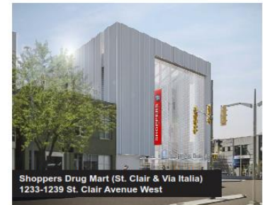
Shoppers Drug Mart (St. Clair & Via Italia) 1233-1239 St. Clair Avenue West